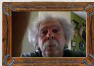
CO-OWNER OF TEXAS BAR-B-Q JOINT