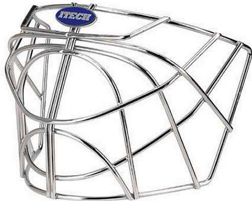
Itech RP624 Certified Cat-eye

The NCRHA requires all participants to use H.E.C.C. approved and compliant helmets and cages.