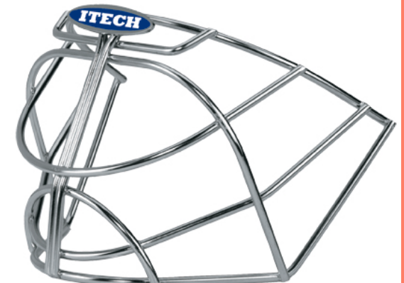
Itech RP615/RP619 Non-certified Cateye