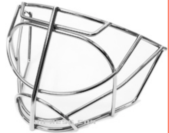
Non-certified Pro-style Cat-Eye